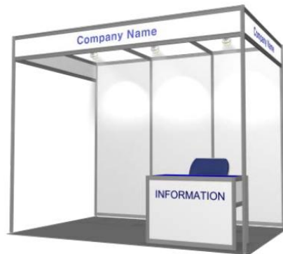
< Standard Shell Scheme Booth >