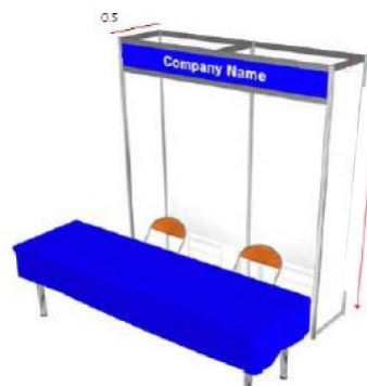
< Table Shell Scheme Booth >