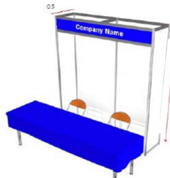
< Table Shell Scheme Booth >