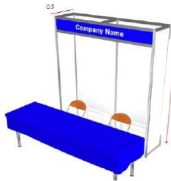
< Table Shell Scheme Booth >